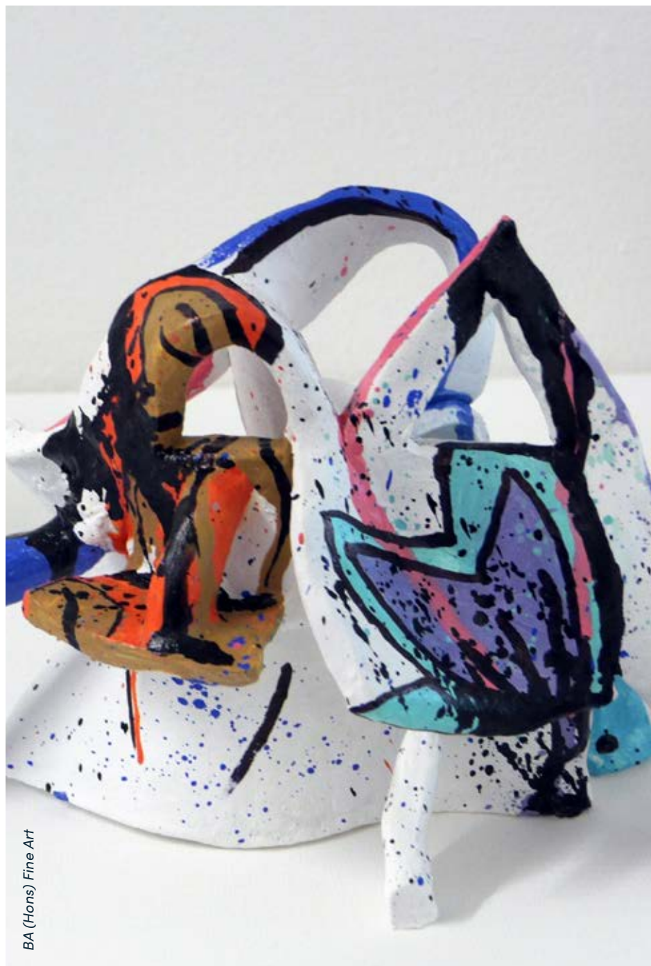
BA (Hons) Fine Art