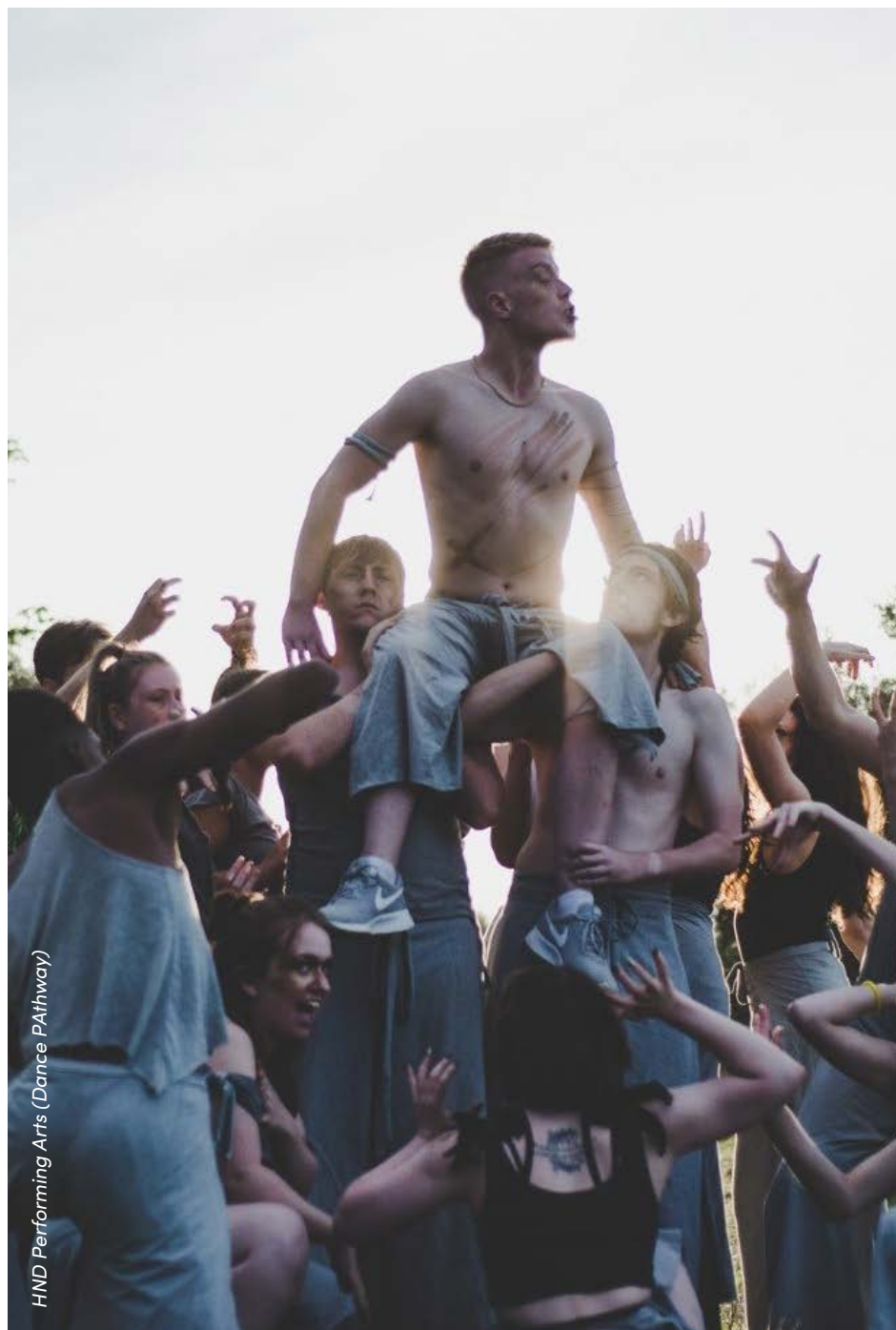
HND Performing Arts (Dance Pathway)